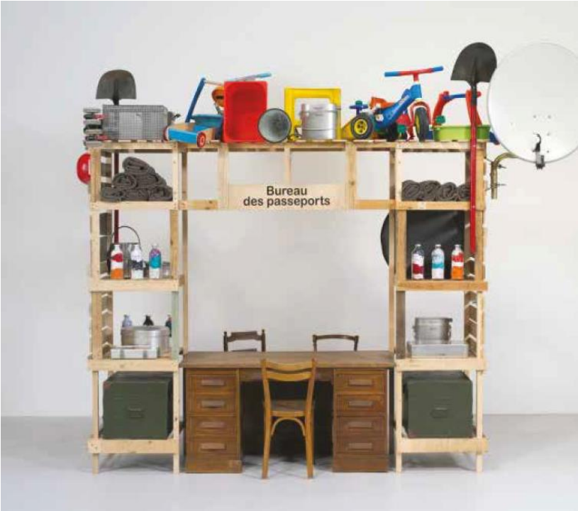
Studio Orta Antarctic World Passport Bureau