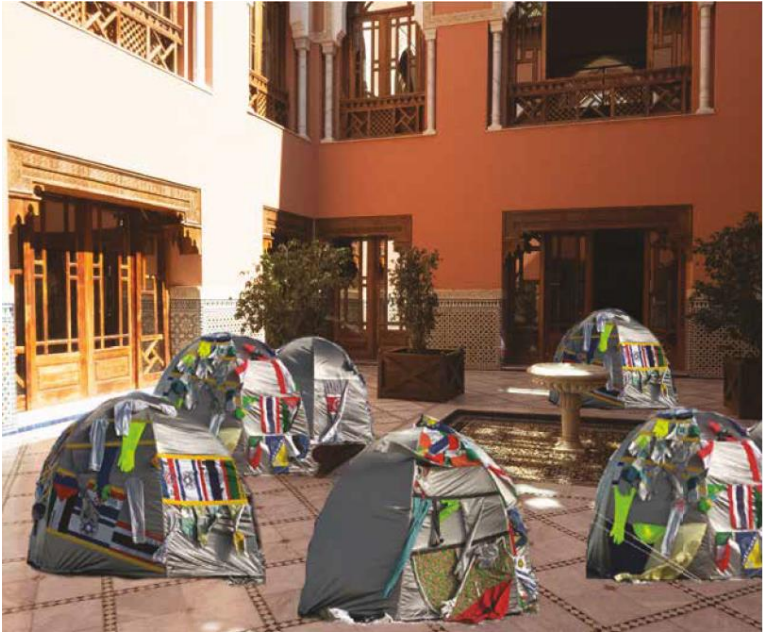
Studio Orta Antarctic Village (10 dome tents with embroidery)